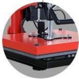
12**15" Size: Popular size and versatile