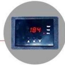
GY-04 Digital Controller: Accurate in time and temp. display