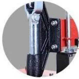
Limited Rod: Stand still, more safty