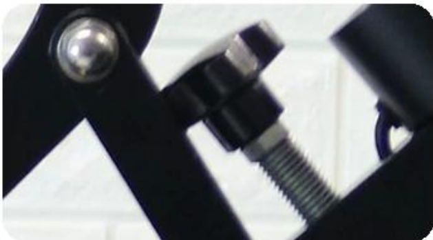
Pressure Adjust Knob: To adjust the pressure easily when sublimate items with different thicknesses.

Intuitive Interface: The user-friendly interface of the control box allows for easy operation, calibration, and adjustment of various settings, ensuring precise and consistent results.