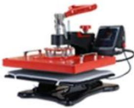
T-shirt Heat Press