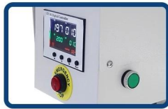
GY-06 Digital Time & Temp. Control Safe start button and emergency stop button