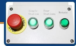
Each station can be operated independently 4 stations rotate fully automatic