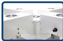
Cooling fans to dissipate heat