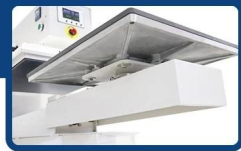
Exchangeable under plate