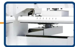
4 working stations