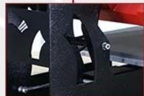
Double Gas Spring