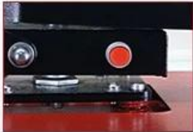
Manual Release Button For Emergency Issues