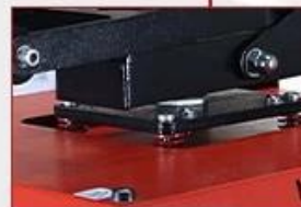
Pressure Balance Spring