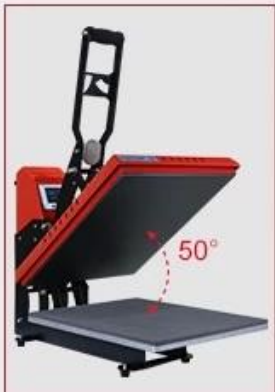
Wide Open Angle