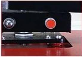
Manual Release Button For Emergency Issues

Auto Open Heat Press: TC-15/ TC-20 Size: 15"x15" & 16"x20"