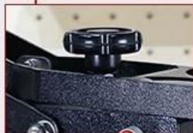
Adjustable Press Pressure