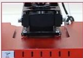
Anti-Scald Protect Cover