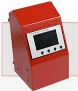
Changeable Electric Box For Easy Maintenance