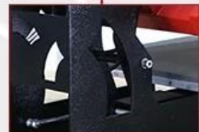
Double Gas Spring