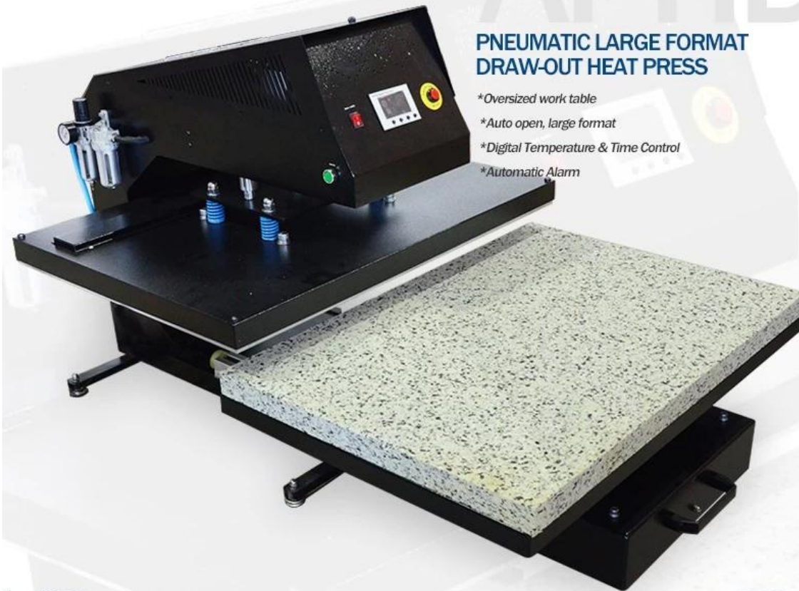
GY-06 Digital Time & Temp. Control