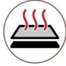
Even Heat Even Pressure