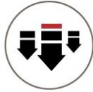
High Pressure Application