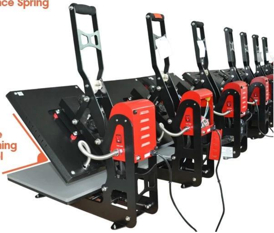
Large Opening Angel