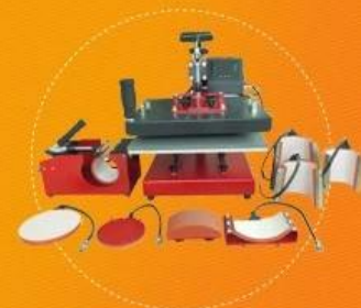
Digital Combo Heat Press Model No.: DCH-800