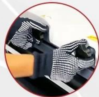
Adjustable Pressure Settings