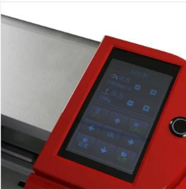
Large LCD touch screen