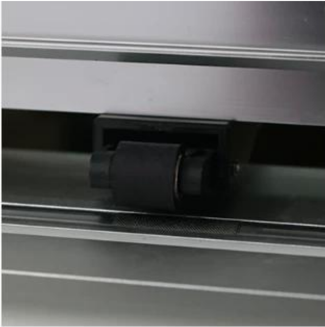
one-in-all barbed steel high cutting accuracy