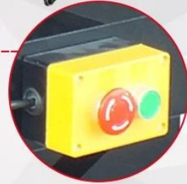
Emergency stop button