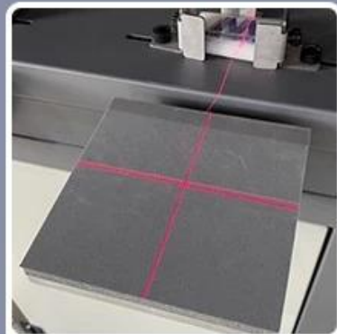
Precise positioning function