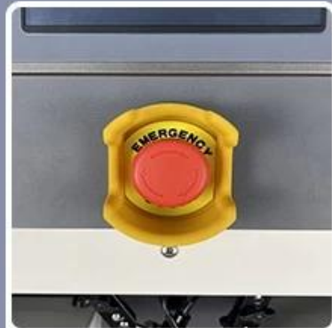
Emergency Stop Switch