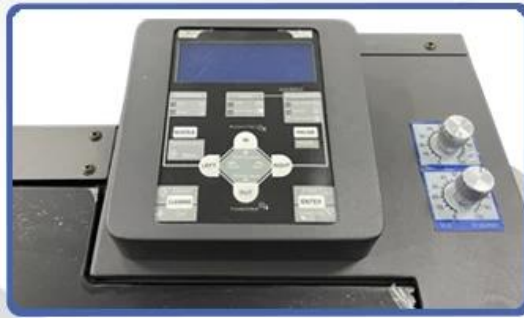
NO.2 Digital Operation Display System