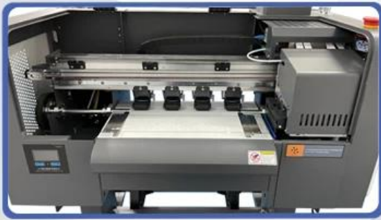
NO.1 Print Head Carriage & Heavy Pressure Roller With Rub