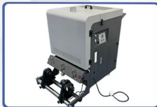
NO.6 DTF Powder Shaker with DTF Film Taking Up System