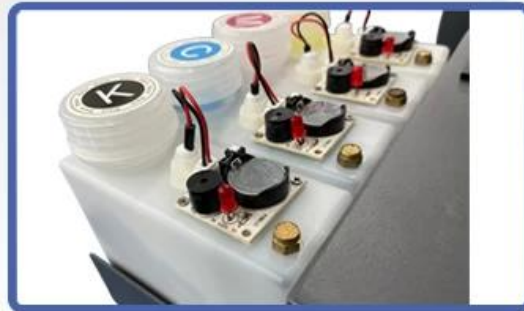
NO.4 Ink Shortage Alarm Device