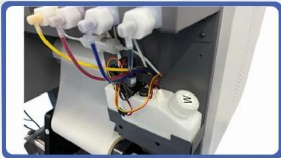
NO.3 White Ink Circulation & Stirring